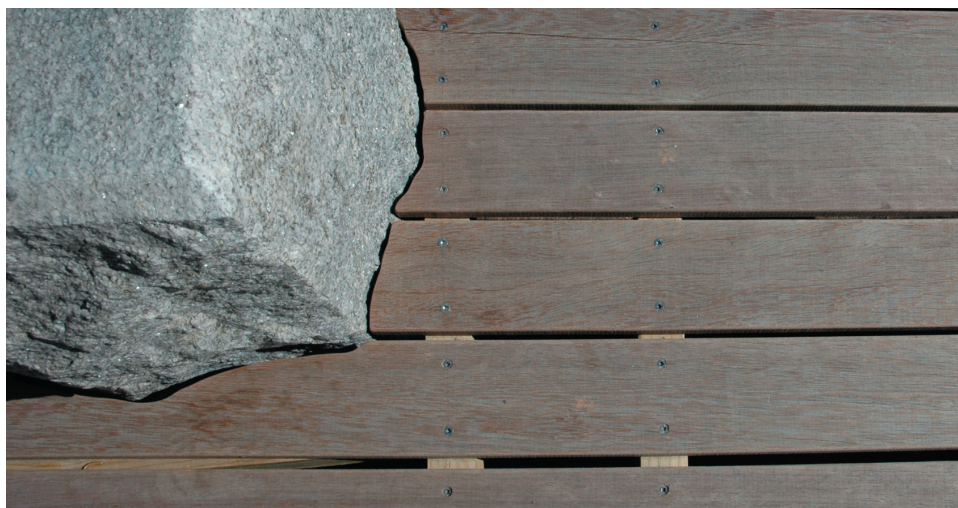
Scribing around stone bollard