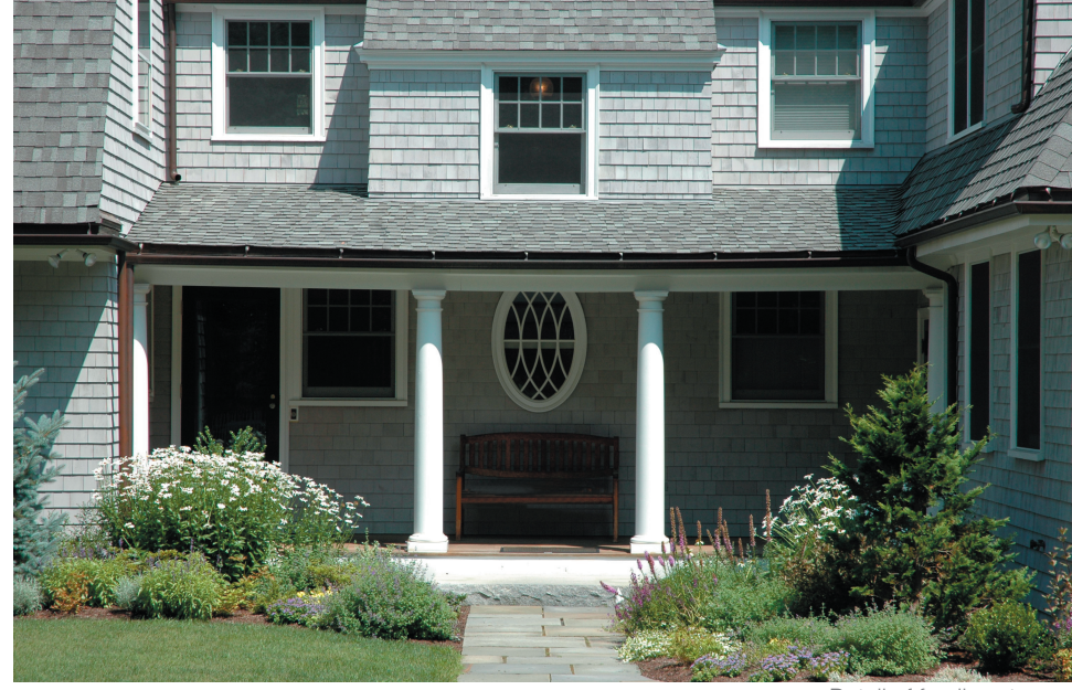
Detail of family entrance