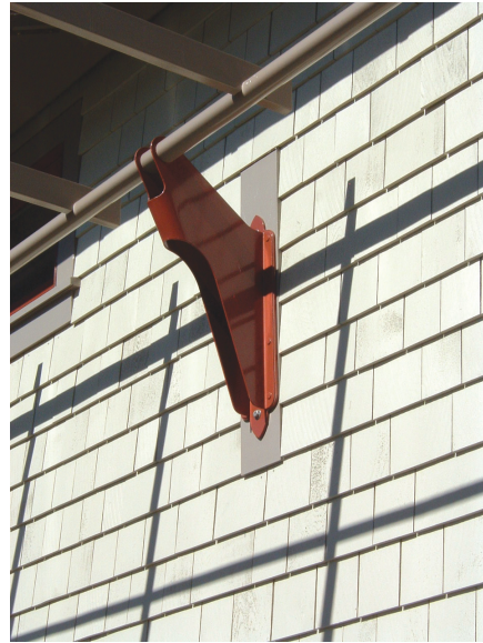
View of trellis bracket,