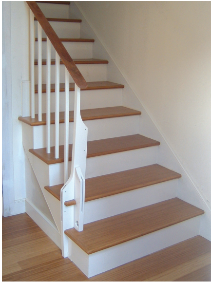
View of custom railing in sail loft