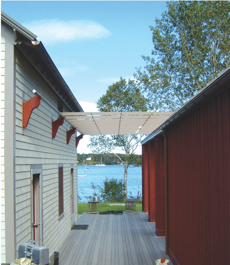
View from interconnecting deck