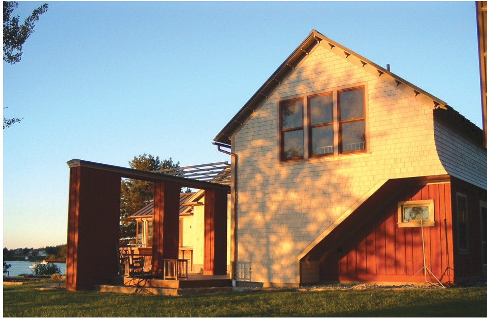
View of sail-loft building