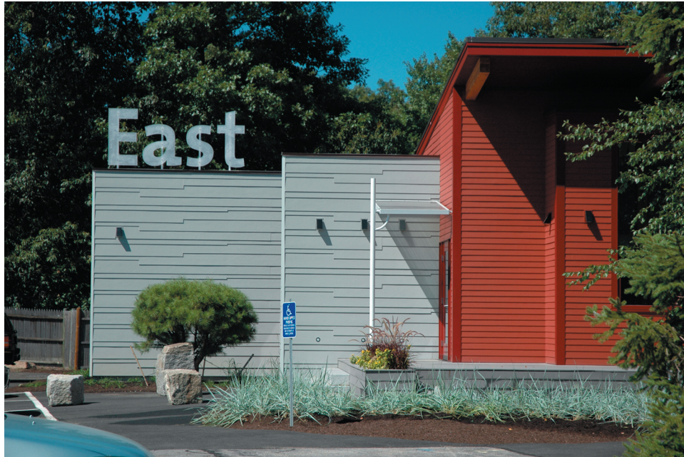
View of East Building with signage by Kimo, Inc.